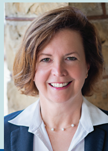
CLARET CENTER Resources for the human journey

For more information or if you need help, you can call the parish office or go to the parish website.