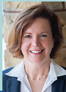
CLARET CENTER Resources for the human journey

For more information or if you need help, you can call the parish office or go to the parish website.